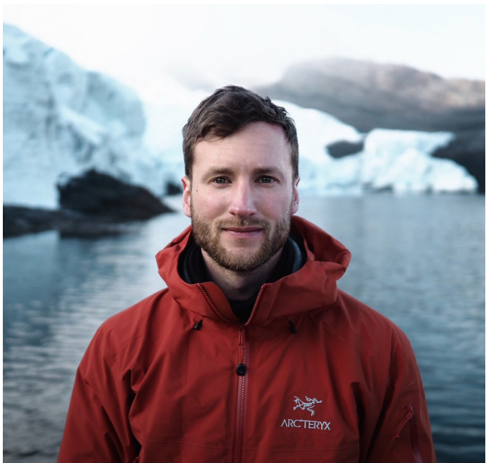
Photo tour in Kamchatka